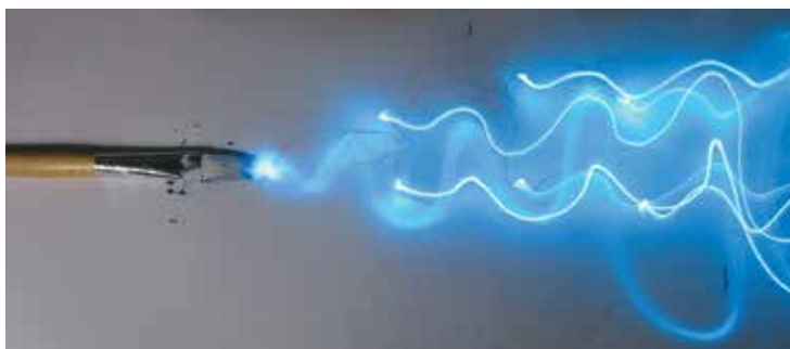
Charlotte Wallace - L2 Photography