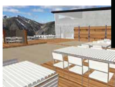
YEAR 12 - Juke Boxes and a Porters Heights Café Design