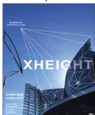
Zoe Robinson - L2 Design