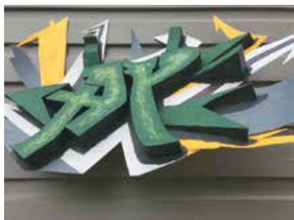
Apisit Pothirook - L1 Art