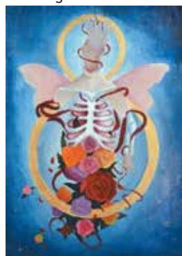
Anastasia Dunwoodie - L2 Painting