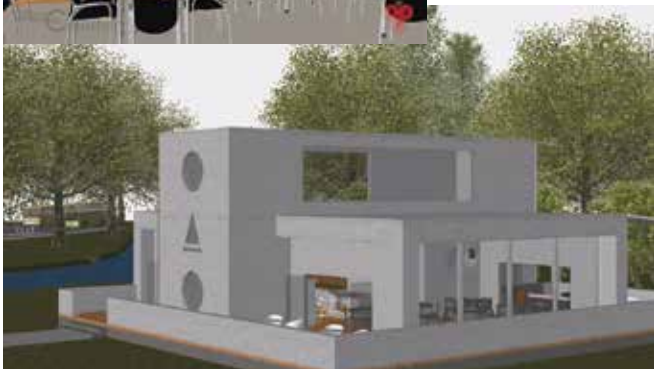
Year 11 - Tasting Room Design