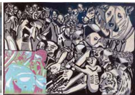
Giese Mae Natural - L2 Printmaking