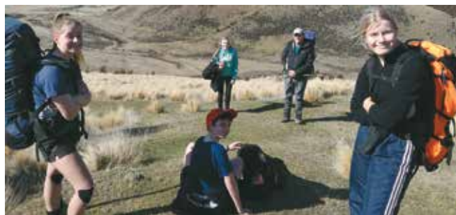
Youngman Stream hut appeared on the edge of a clearing 50 meters from the river.