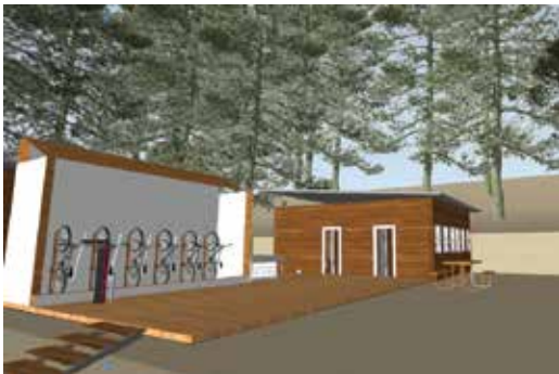
Year 10 - Toys and Christchurch Adventure Park Accommodation

On Saturday the 20th October the DAP301 students held their end of year Exhibition. Not only did they show case some excellent design work but earned themselves a Level 3 Achievement Standard in Exhibition Design.