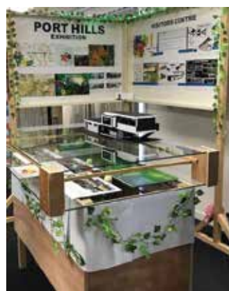
Year 13 - A Donation Facility for the Christchurch Homeless Appeal, and Ski Field Facilities