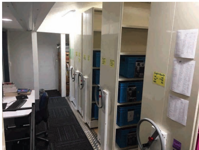
New library storage room for safe keeping of faculty resources.

Printed on elemental chlorine free paper. FSC certified pulp sourced from well managed & legally harvested forests.