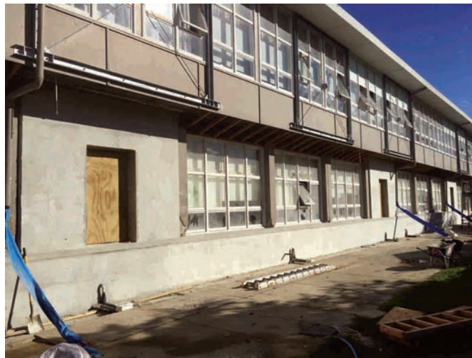
The external strengthening work on the outside of A Block almost completed (B Block also done).