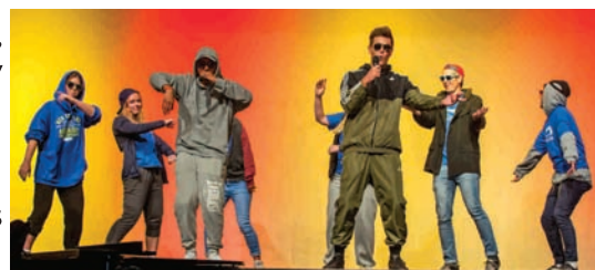
Cooper House Talent Quest entry

As always, involvement is the key. Get involved in the House activities as they provide great opportunities to make new friends, support your House and add to the vibrancy and excellence of the school