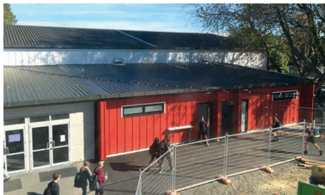
The new extension on our gym (in orange) with changing rooms and toilets for our students.