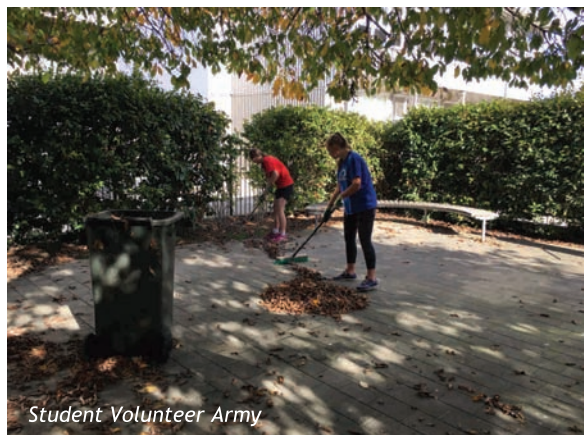
Student Volunteer Army