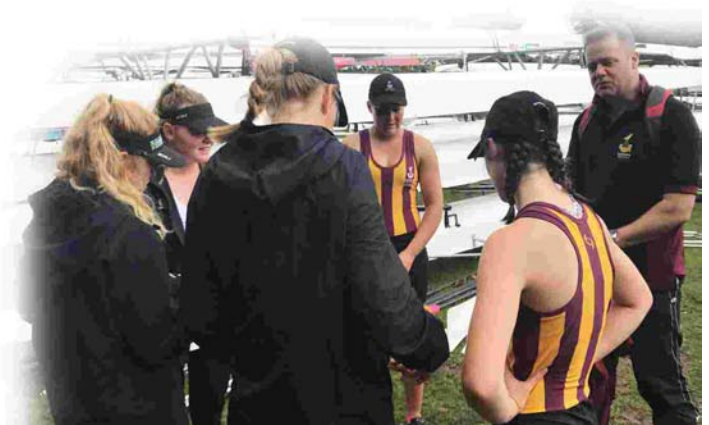
Principal with girls after event in rowing regatta