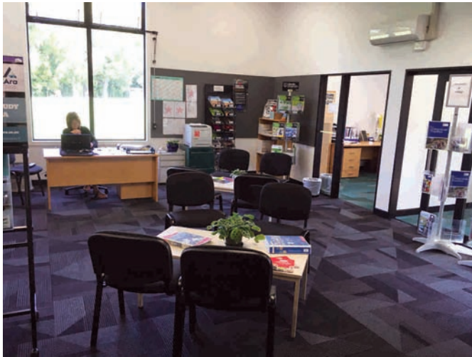
Inside our new Careers Pathway student support area. This new extension to our library for our students to visit to get advice and guidance on various tertiary education (e.g. university and polytechnics), career options, and pre-trade courses.