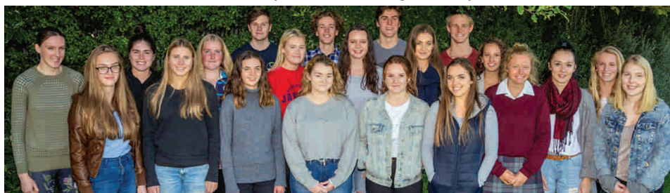
2017 Formal Committee