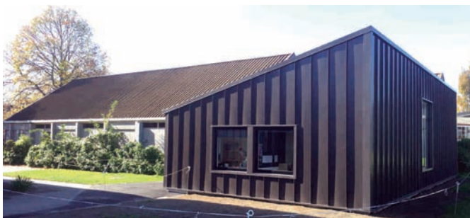
Outside view of the new library extension - for careers and storage room.