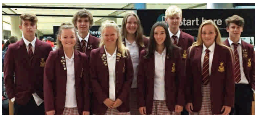
Maadi Cup Rowing Squad