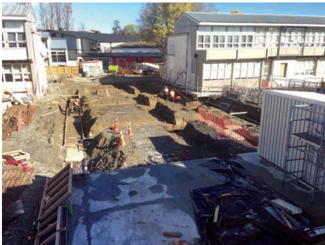
The foundations are now well underway for the new 'Portal Block' (formerly the north-south wing of B Block). This two-storey block will have new Art classrooms and offices for Head of School on the ground floor; and upstairs new English and Media Studies classrooms along with a staff work area.